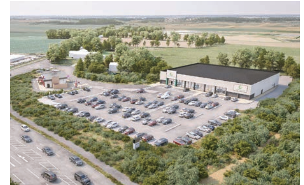
SOUTH HOLLAND RETAIL PARK