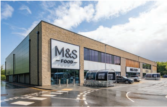
ST MICHAELS RETAIL PARK

Rothstone specialise in roadside & retail development projects across the North of England. Below are some examples: