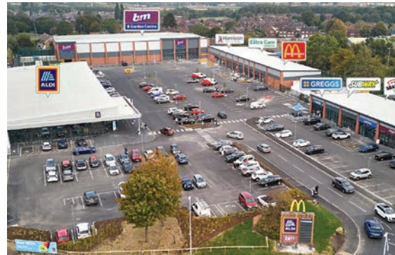
ST GEORGES RETAIL PARK