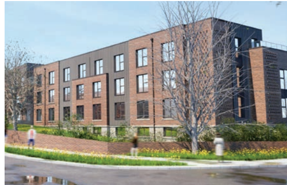
PARSONAGE STREET, MACCLESFIELD